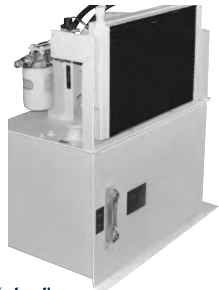
Hydraulic Power Unit