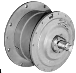
Model CBH Clutch-Brake

Industrial Clutch Products will be pleased to provide conversion assistance to ensure a successful installation.